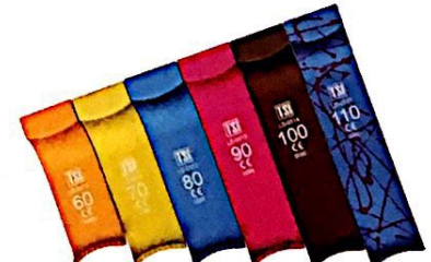
LS-0510 through LS-0515 Phantom Wide, Offset Lumbar Blades with Light Guide