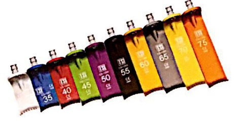
CS-1250 through CS-1259 Phantom Cervical Blades with Short Teeth and Light Guide