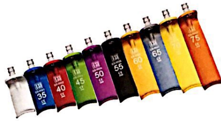
CS-1220 through CS-1229 Phantom Cervical Blades Blunt with Light Guide