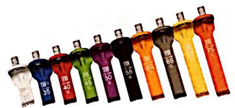
CS-1290 through CS-1299 Phantom Cervical Micro Blades with Short Teeth and Light Guide