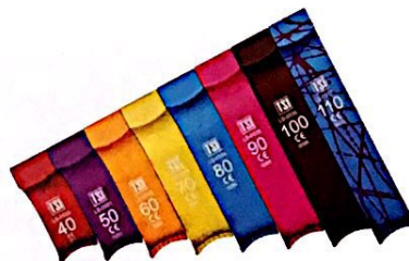
LS-0500 through LS-0507 Phantom Narrow, Offset Lumbar Blades with Light Guide