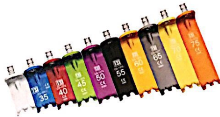
CS-1270 through CS-1279 Phantom Cervical Blades with Long Teeth and Light Guide